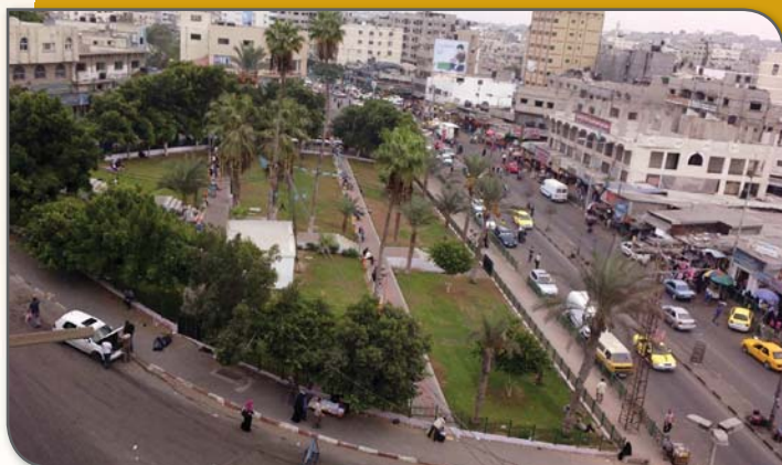
Life and landscape in Shujayia before the Israeli attack