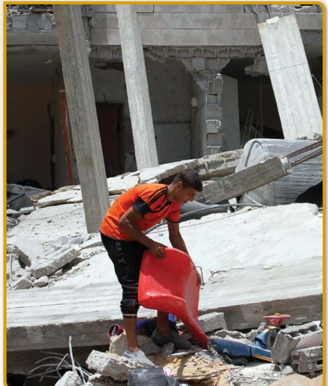
In Gaza City, a man pulls children's toys from the rubble of his home.