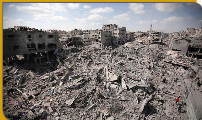
The devastation of Shujayia