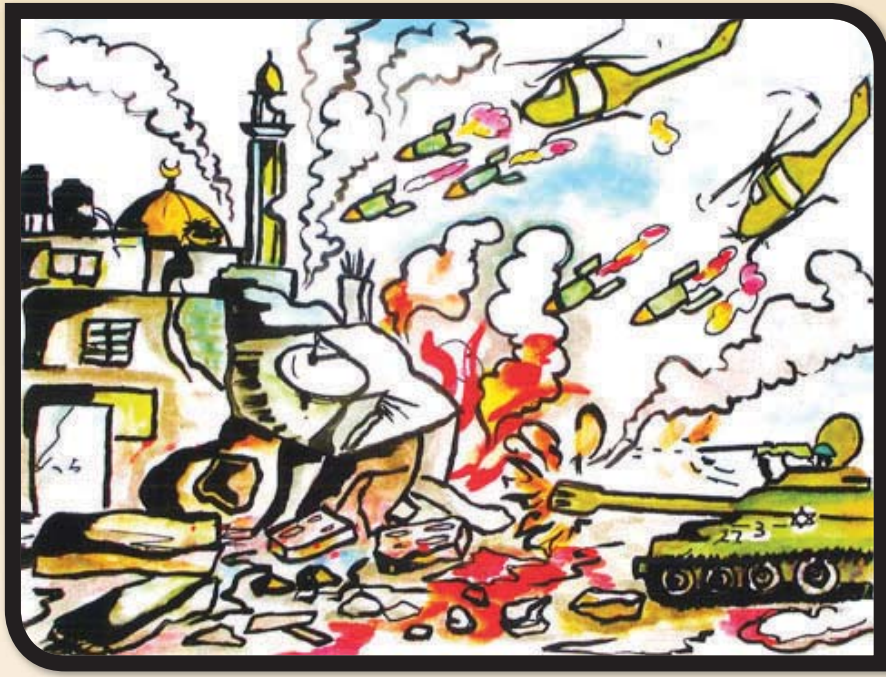
A young adult's impression of Gaza under attack.