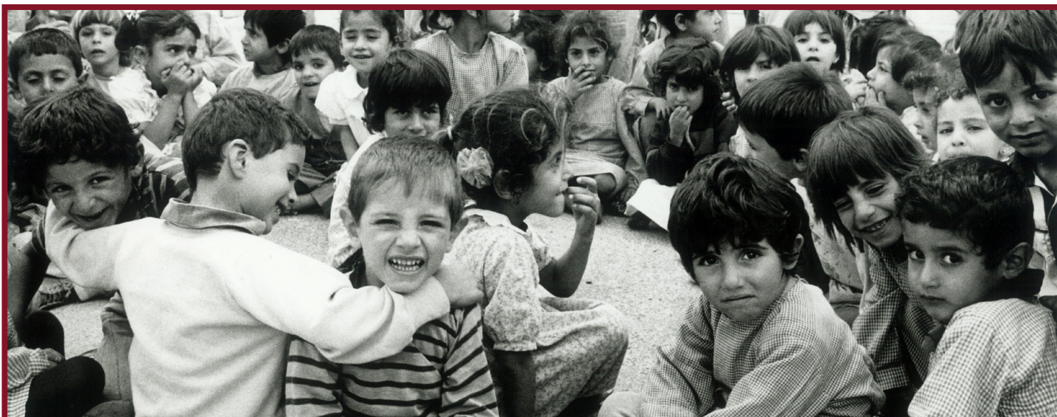
A UPA-supported pre-school in Bani Na'im, West Bank, in 1988. This year, UPA marks 39 years of transforming lives.

Non-Profit Org. US Postage PAID Jacksonville, FL Permit No. 34