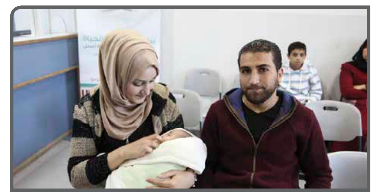
Parents of a child with a cleft-lip during ELP screening.

Your support goes a long way, and we are very grateful.