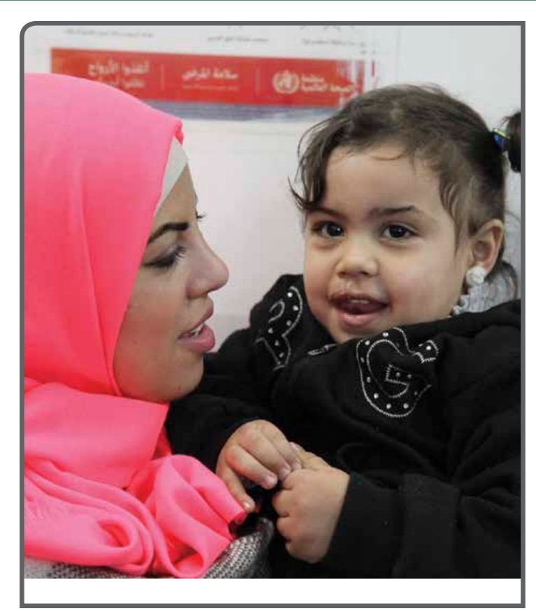
A mother with her baby during ELP screening.

To learn more about the ELP, please visit: www.helpupa.org/embracing-life