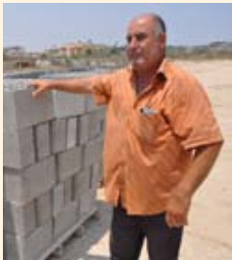
▲ Faisal Abu Warda's concrete block plant