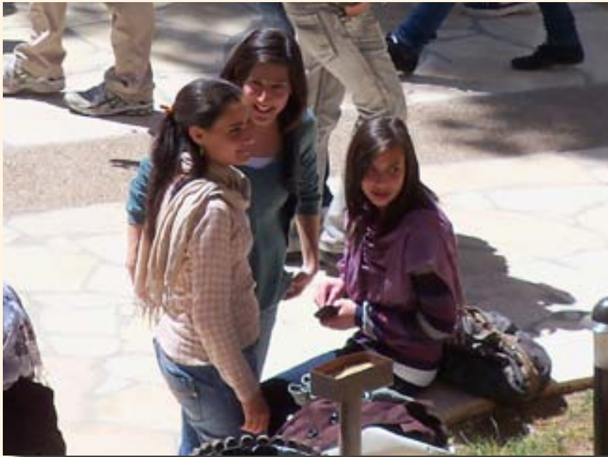
Students at Bethlehem University.