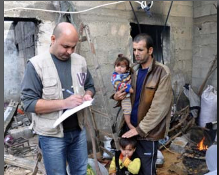
A UPA partner organization assesses the damage during the November 2012 assault.